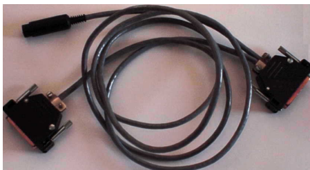
Figure 2: A parallel cable to genlock 2 machines. Beside the two DB25 connectors, we can distinguish a female mini-din 3 connector to plug the IR emitter of the shutter glasses.

Active stereo requires displaying alternatively the left eye and right eye images with shutter glasses masking the user's opposite eye. Image and shutter switching must occur before each video retrace: